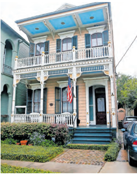
Late Victorian design is common in Algiers Point, with many houses built after an 1895 fire. The style peaked in popularity at that time.

And that's what drove the counter-reaction. It began in England in the 1880s, and took root in the United States by the early 1900s. Its