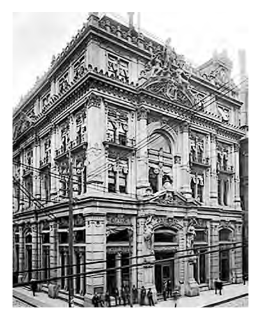
The New Orleans Cotton Exchange, built in 1871 in the Victorian Second Empire and Italian Renaissance styles, was razed in 1920.

the Eastlake, old colonial, etc.(,) all of which will prove to be ornaments to the city."